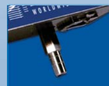
Barbed Vacuum Connector