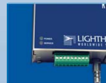
Screw Terminal Connector