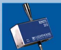
Stainless Steel Enclosure