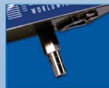
Barbed Vacuum Connector