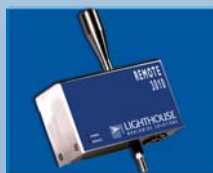
Stainless Steel Enclosure