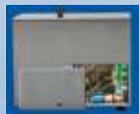
Internal Vacuum Pump